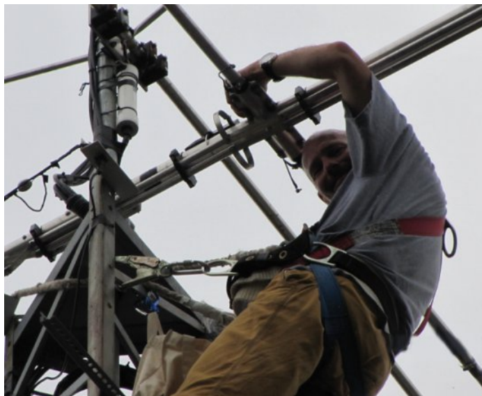
A Word from the President

The president's letter was not available this month. Please bug your president to submit his letter on time for the next issue!