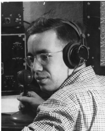
McGill amateur radio station, 1951.